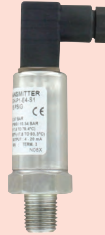
General Purpose Housing (-GH) with DIN C