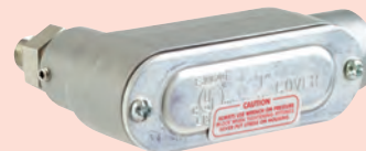
Conduit Housing (-CH)

*Please see our website for dimensional drawings.