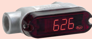
626 with LED Display (CH housing only)